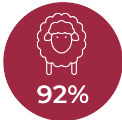
Animals in School