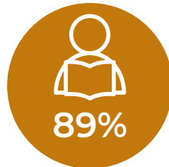
Research in Education