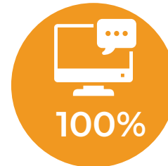
EmPowerpointing Your Lessons