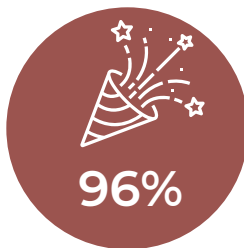
Celebrating Student Capacity