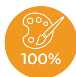
Making Space for Art in your Classroom

WORD CLOUD Delegates were able to leave comments throughout the evaluation process from which we have selected key words to provide the sentiment experienced at the conference.