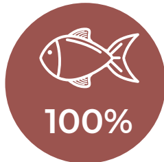
Marine Studies in Alternative Education